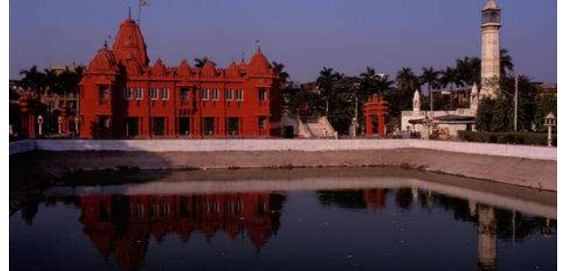
DIGAMBARA TEMPLE Kolkata

Meals at Delhi, Khajuraho & Kolkata will be by Hotels and rest of the tour by our own Chef